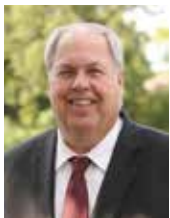
Attorney Vincent Bobot SDC Commissioner, District 6