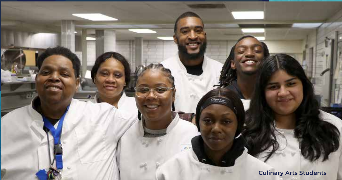
Culinary Arts Students