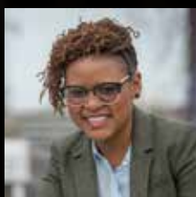
Rep. Park Cannon