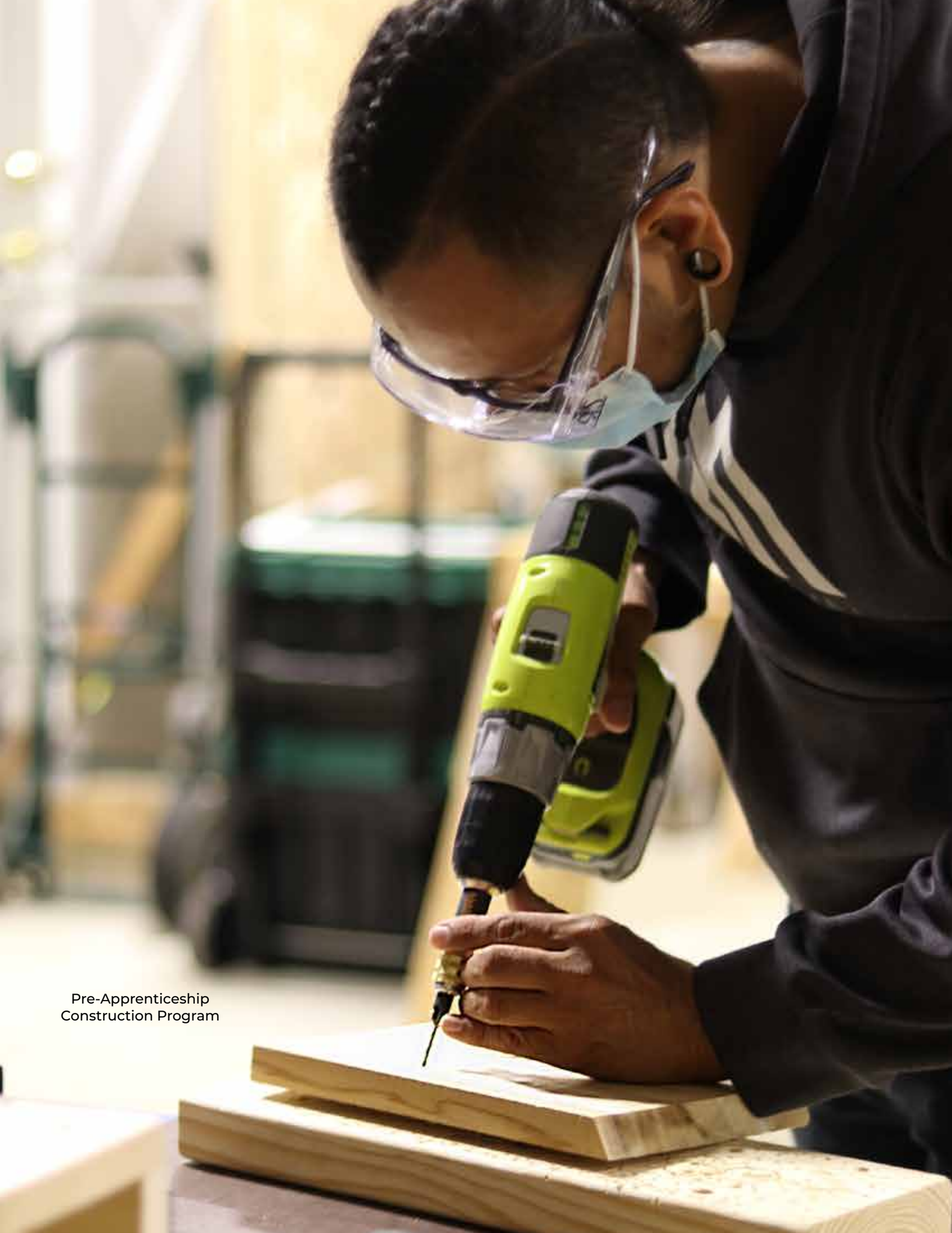
Pre-Apprenticeship Construction Program