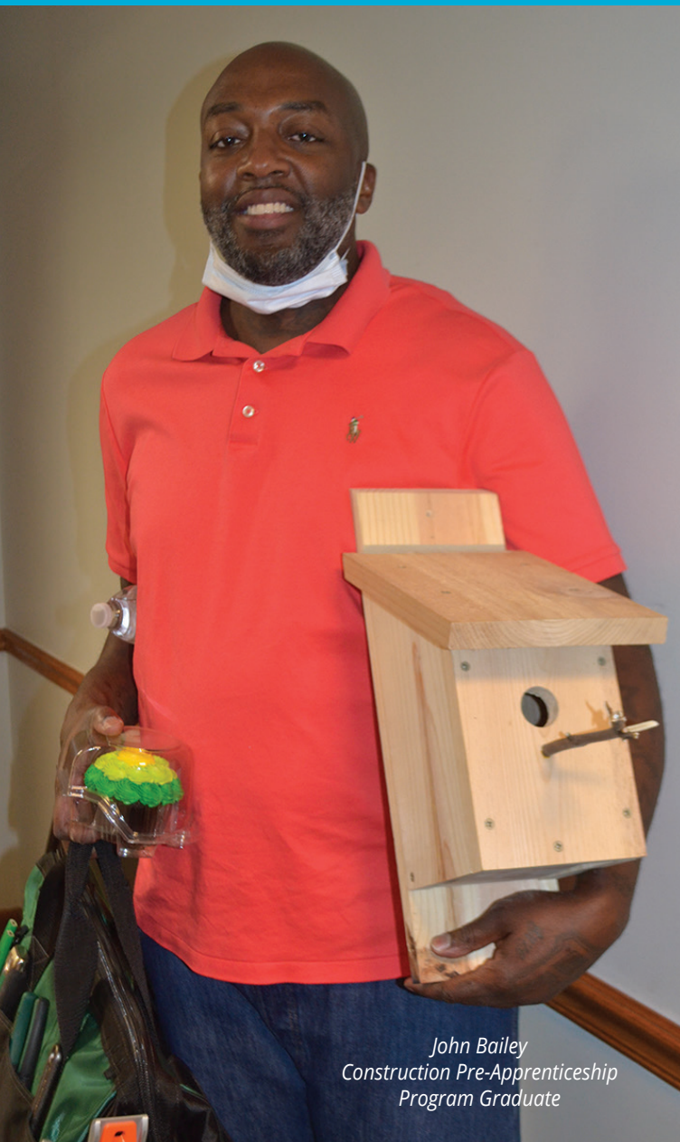
John Bailey Construction Pre-Apprenticeship Program Graduate